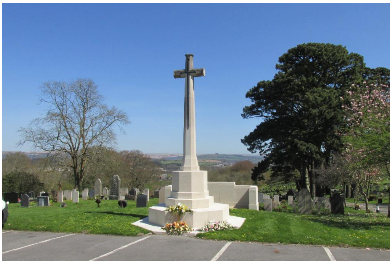
Cross of Sacrifice in Efford Cemetery, Plymouth