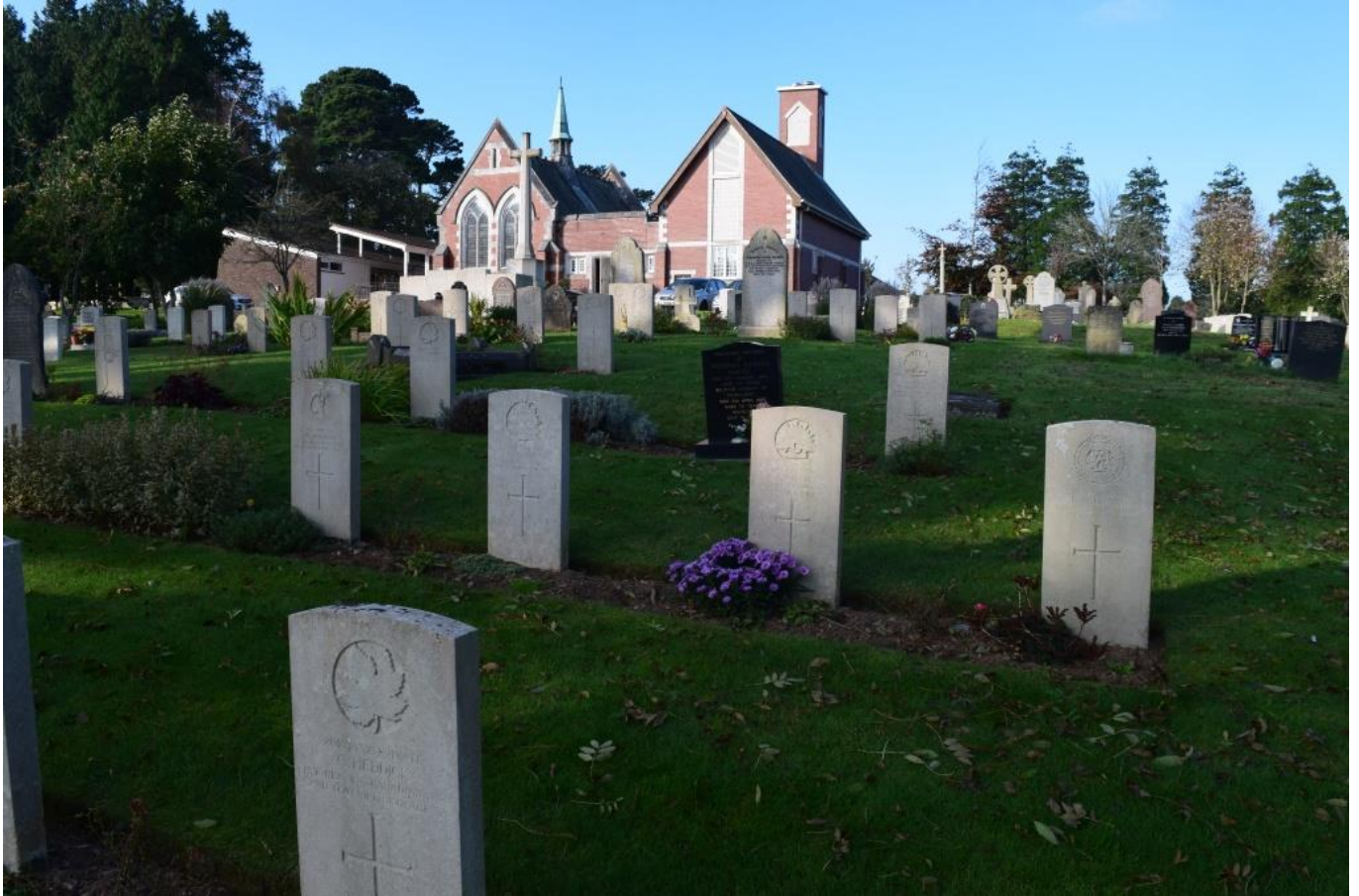
War Graves in Efford Cemetery, Plymouth